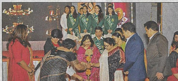
Mount Olympus School, Sector 47, Malibu Town

The dynamism of the learners was palpable in the young anchors presenting the school Annual Report.