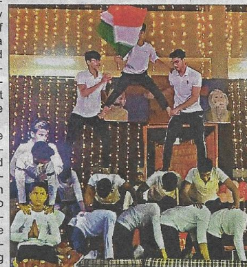
Euro International School Sec-45, Gurgaon