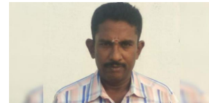
Madurai loco pilot feted with badge of honour for quick response