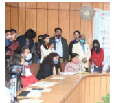
Shrishti Go... excels as or Uttarakhan receives pra... Trivendra S Rawat

Now we are on Telegram too. Follow us for updates