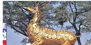
Scrap metal moulds into golden deer in Jajpur