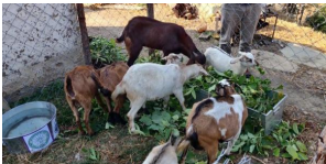
'BAKRAW' initiative is enhancing livelihood of farmers in Uttarakhand Hills through goat, sheep rearing